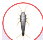
GREY SILVER FISH