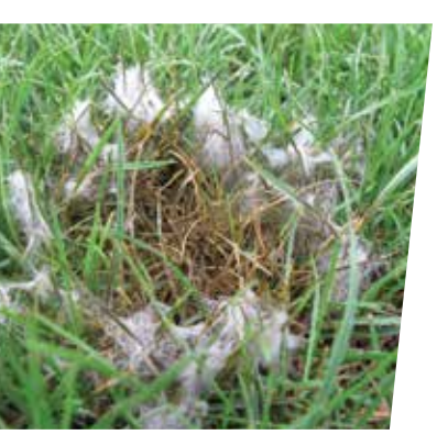
Prolific aerial mycelium is a characteristic sign of Pythium blight.