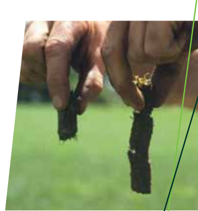
Pythium root rot reduces root mass in cool or hot, and wet conditions.