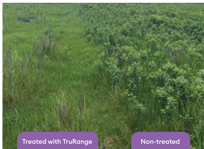
Two-year continued control of western snowberry

After three days of not eating treated foliage or not grazing in treated areas, the animal's manure is no longer subject to the above restrictions.