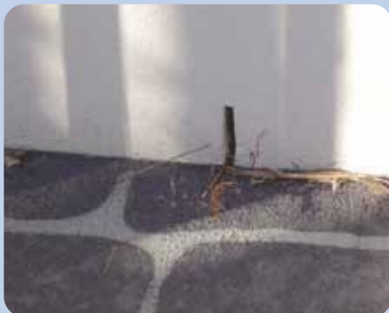
Solution: Install Kordon to detail Kd041b – refer to accredited Kordon installer for further information before installing pathway