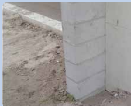
Solution: Install Kordon to the vertical between brickwork and structure