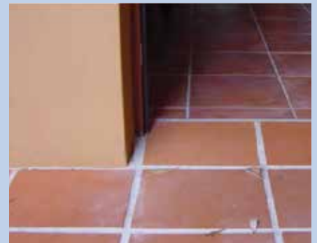
Solution: Install Kordon to detail Kd041b – refer to accredited Kordon installer for further information before pouring entry