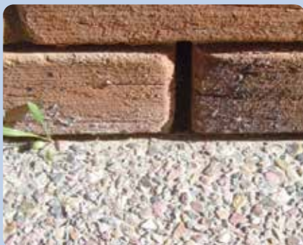
Solution: Install Kordon to detail Kd041b – refer to accredited Kordon installer for further information before installing pathway