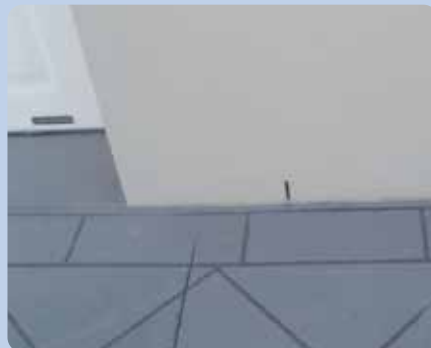
Solution: Install Kordon to detail Kd041b – refer to accredited Kordon installer for further information before pouring driveway