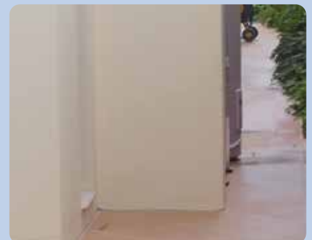
Solution: Install Kordon to the vertical between nib wall and structure